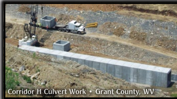
Corridor H Culvert Work • Grant County, WV

If there's a way to perform the work more efficiently, we'll find it, trimming time off the schedule, costs from the budget, or both, enhancing the project for the entire team through Value Engineering where applicable.