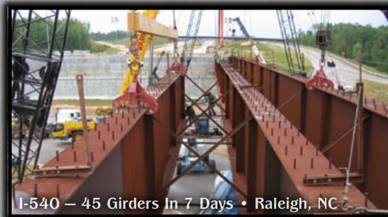
I-540 - 45 Girders In 7 Days • Raleigh, NC