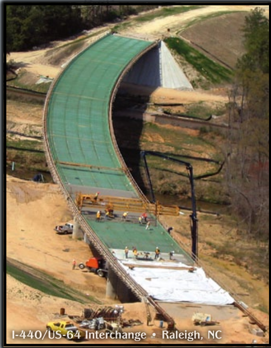
I-440/US-64 Interchange • Raleigh, NC